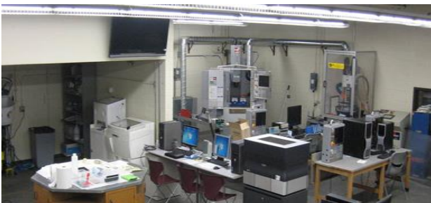
DENSO Design & Manufacturing Laboratory