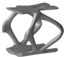
Optimized unit cell result for single plane shear on three consecutive unit cells in Inspire