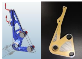
Optimization analysis of a motorcycle bracket in Inspire and 3D fiber-reinforced printed result