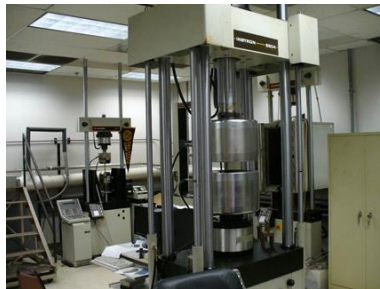
Instron Testing Laboratory